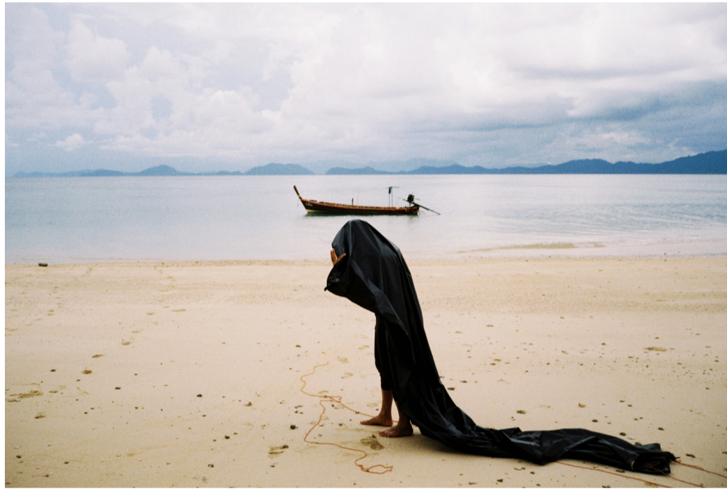
Image from POEM 20 Foreigners and The Area of Four to Eight Sunny Rain , 2023, Color photograph

Thru the Straits of Demos , a solo exhibition by Thai artist Kornkrit Jianpinidnan. Running from April 22 to June 3, 2023, the exhibition presents photo-installations drawn from three new volumes of the artist's long-term visual-poetry project, POEM . Based on an amalgamation of research, sightseeing, and daily living, Jianpinidnan's explorations of the relationship between experiences and memory repositions photography as a tool for the conveyance of truth and reality.